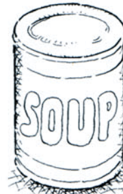
1 can cheddar cheese soup